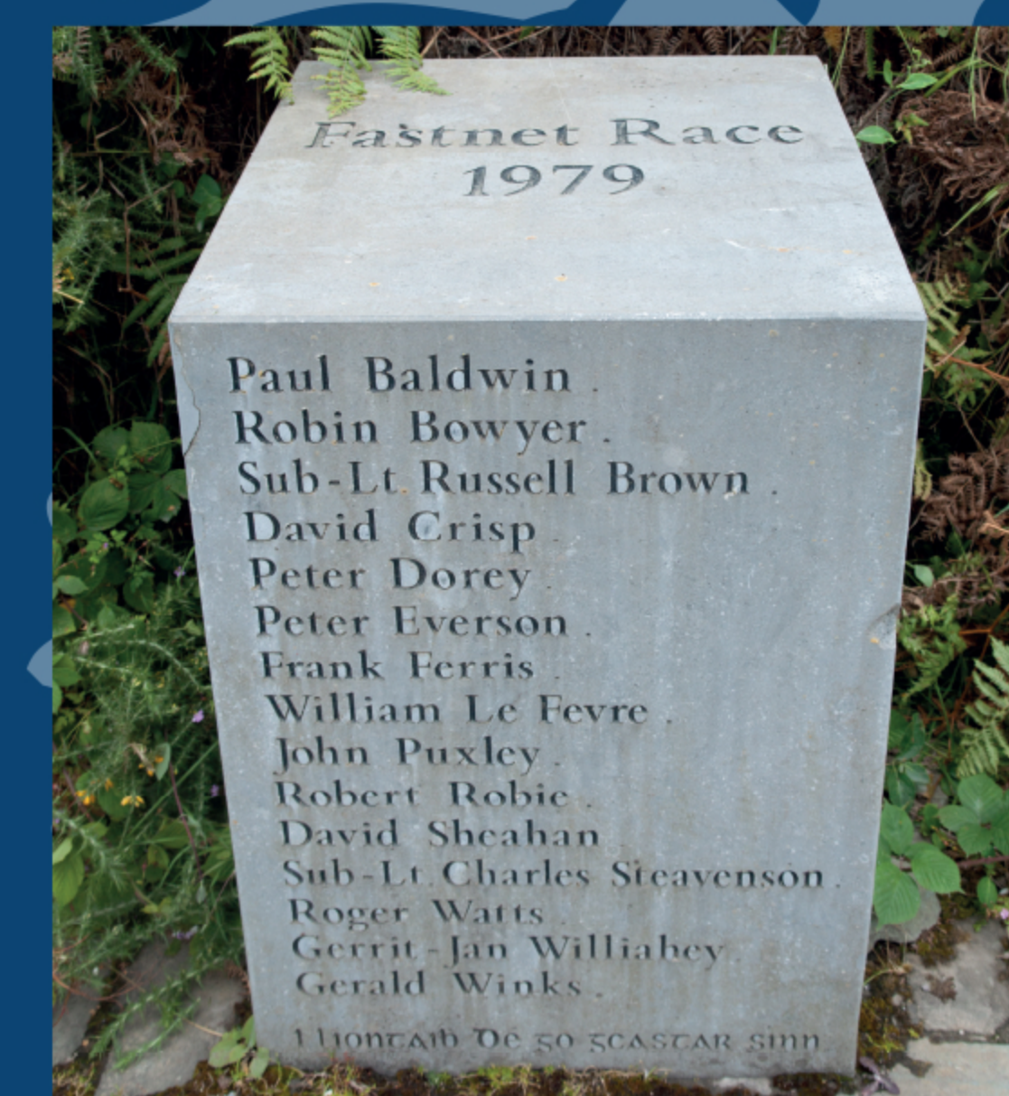
1979 Fastnet Memorial: Cape Clear, West Cork