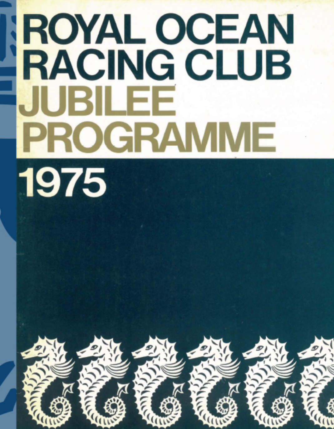
1975: The RORC Jubilee Programme, marking a significant milestone in the Club's history