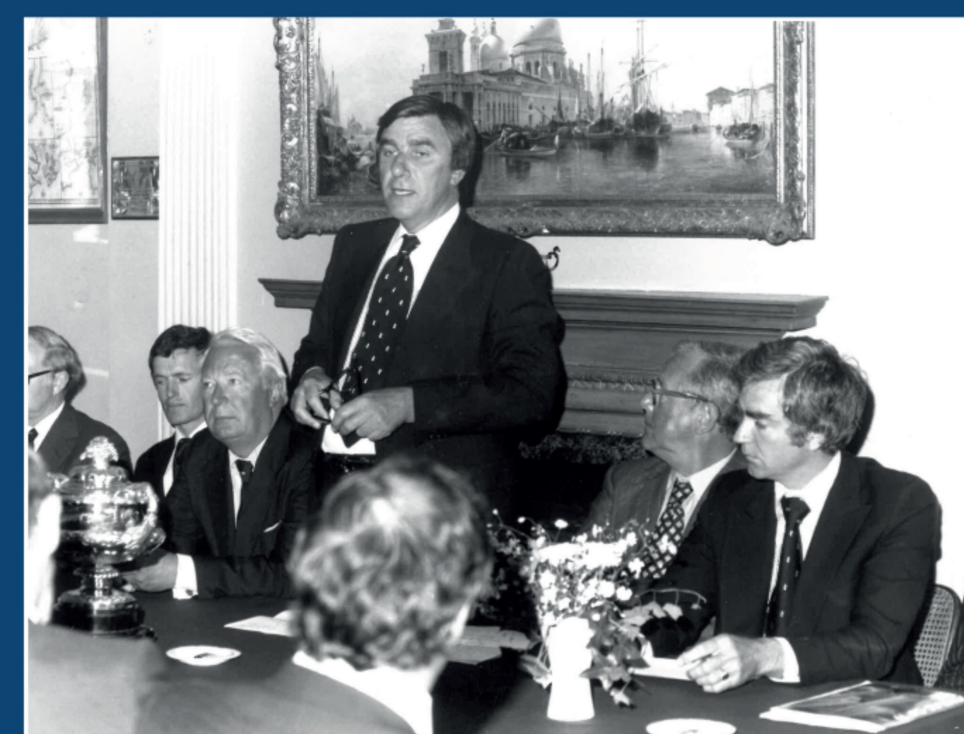
COMMODORE DONALD PARR, PRESS CONFERENCE FOR THE