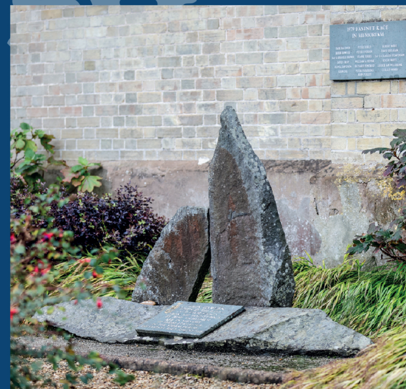
1979 Fastnet Memorial: Holy Trinity Church, Cowes