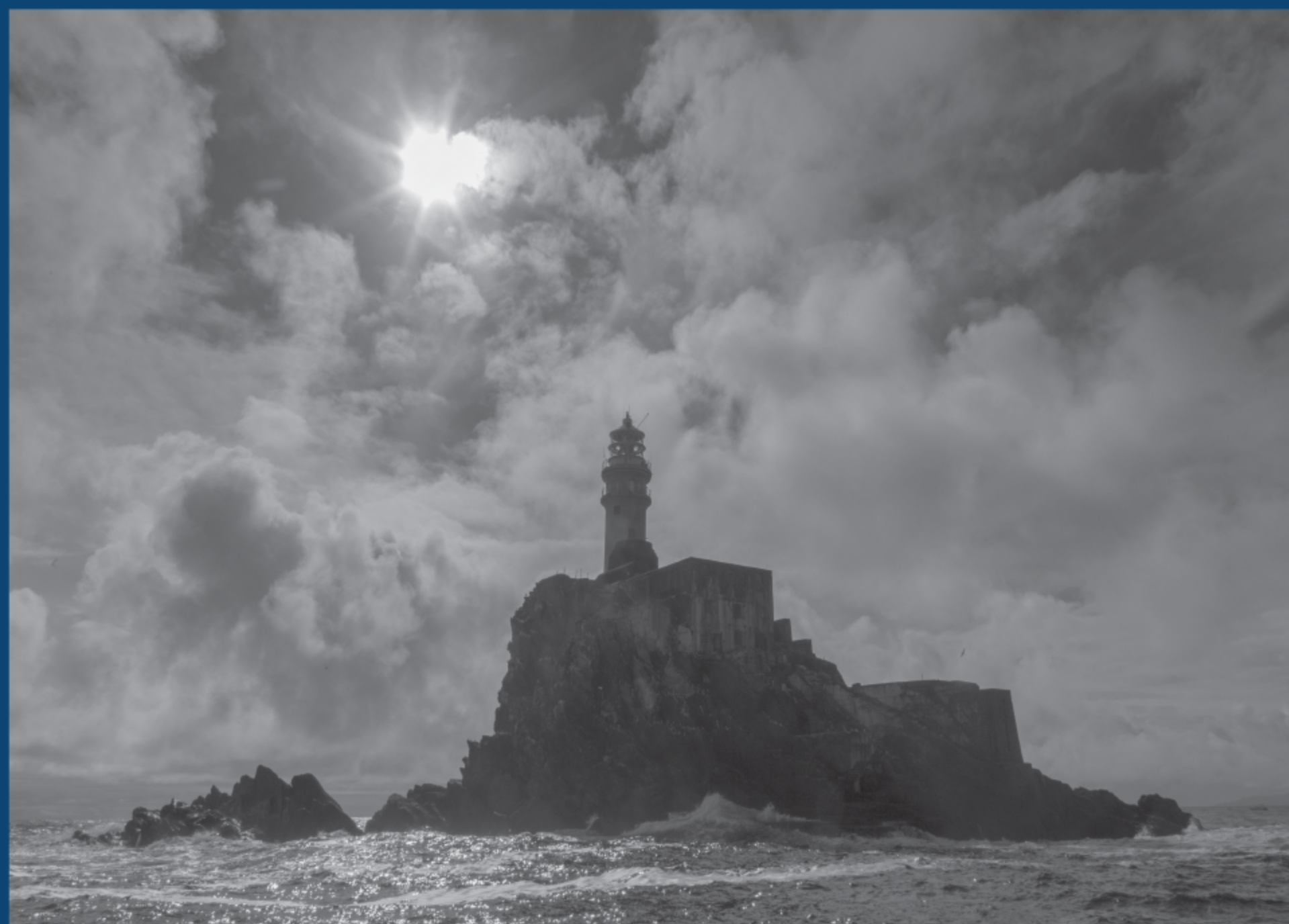
The Fastnet Lighthouse: A symbol of endurance and navigation for all sailors