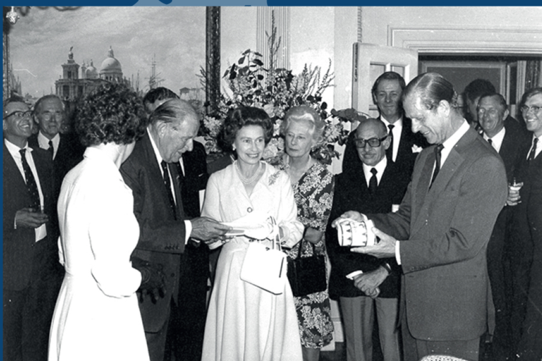
1975: A visit by Her Majesty Queen Elizabeth and HRH Prince Philip to the RORC Clubhouse at St. James's Place