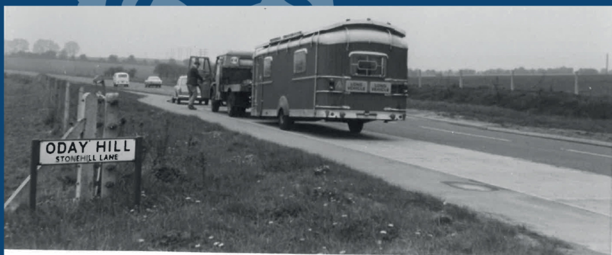
1970's style RORC mobile office